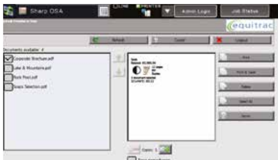
Follow You® Printing

I-Queue eliminates the need for print servers and provides secure, fully-managed printing from any compatible desktop or laptop PC from anywhere within the campus, without having to worry about configuring printer drivers.