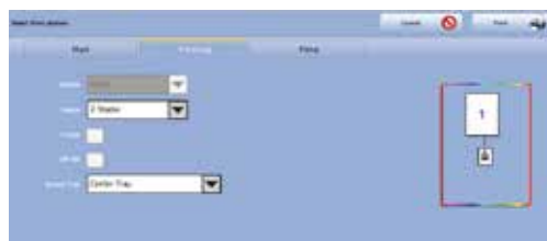
Select finishing options

There's more to this than printing, though. Logging on also unlocks the copy and scan functions and gives you one-touch access to any Single Sign On-compatible Sharp OSA (Open Systems Architecture) applications that you've installed.